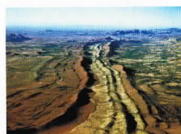
HIGH, WIDE AND HANDSOME: Scenic flights offer an illuminating perspective on the dramatic geological formations of the Flinders Ranges.

Along with the well-appointed guest rooms and Di Fargher's generously laden table of top quality produce expertly cooked, the principal pleasure here is tapping into lan's deep knowledge of the country his family has worked for four generations. Activities include