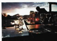
CLOCKWISE FROM TOP LEFT: Eco-villa on Rawnsley Park Station abutting Wilpena Pound; the pool, homestead and outdoor dining on Arkaba Station.