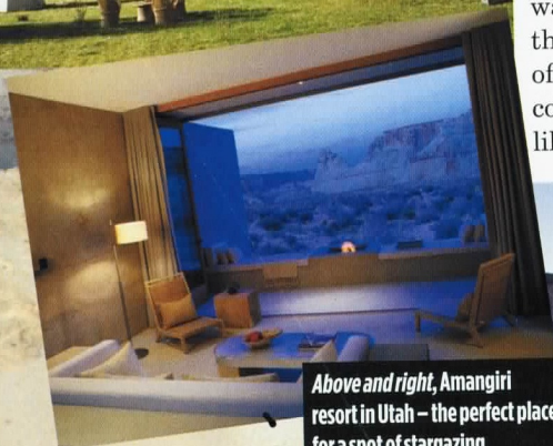
Above and right, Amangiri resort in Utah – the perfect place for a spot of stargazing

If you seek more earthly pleasures, ground yourself at Amangiri in Utah ( Amanresorts.com ), a haven of stone, glass, water and sky, set among 600 acres of sandstone rocks and mountains. Beds can be set out under the stars, where the only sound is the wind, crickets and the occasional bark of coyotes. If sleeping quite so alfresco makes you nervous, book a suite with a sky terrace – a swimming pool set in an enclosed area open to the sky – so you can float away contemplating the mysteries of the universe.